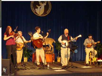
Welcome Reception hosted by Outdoor Underwriters